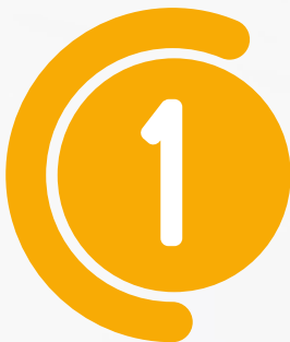
Universal Therapy Included in weekly fee

The Therapeutic Treatment Plan will then be reviewed on a regular basis through the Clinical & Inclusion meetings using ongoing assessment, engagement, behaviour and attendance data. Students will move between tiers as their needs change.