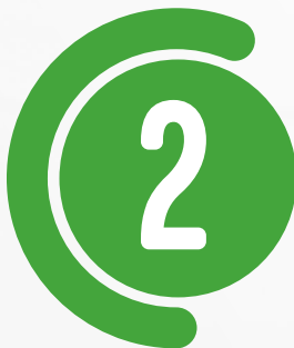
Targeted Group Therapy Included in weekly fee