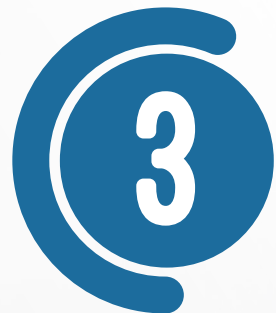
Great Minds Intensive Therapy Available at additional cost